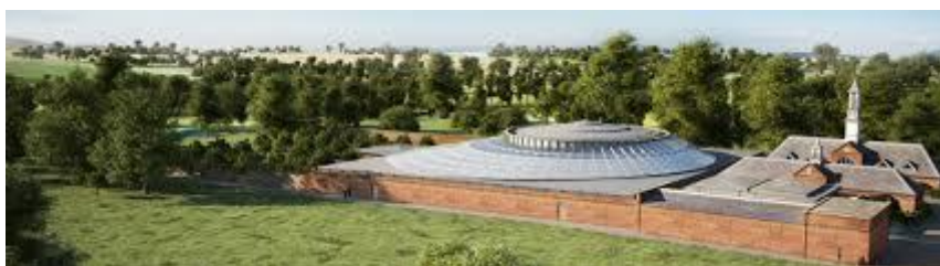
The Wellcome Genome Campus Conference Centre

Bed and breakfast accommodation has been arranged for all external delegates at the Wellcome Genome Campus Conference Centre from 31 July to 3 August inclusive, departing 4 August 2017.