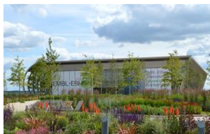
EMBL-EBI South Building

The Hackathon is being held in and around the Kendrew Lecture Theatre in the EMBL-EBI South Building. The South Building is a short walk from the Wellcome Genome Campus Conference Centre and there are on-site signs giving directions. The Registration Desk will be open from 8.30am on Tuesday 1 August 2017, just outside the Kendrew Lecture Theatre.